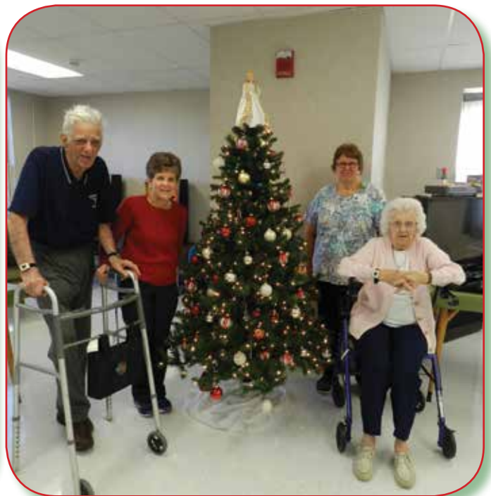
Saint Mary's East