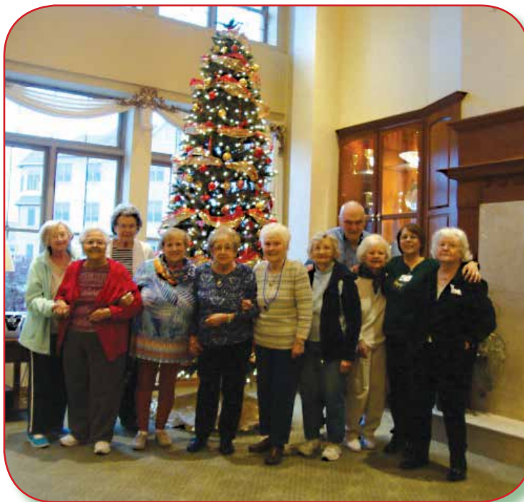
Saint Mary's at Asbury Ridge

Our campuses have been filled with the spirit of Christmas over the past few weeks as Residents and volunteers gave their time and expertise to help decorate our lobbies and activity centers for the holidays. Everyone enjoyed carrying on the traditions of hanging ornaments on the trees with one another!