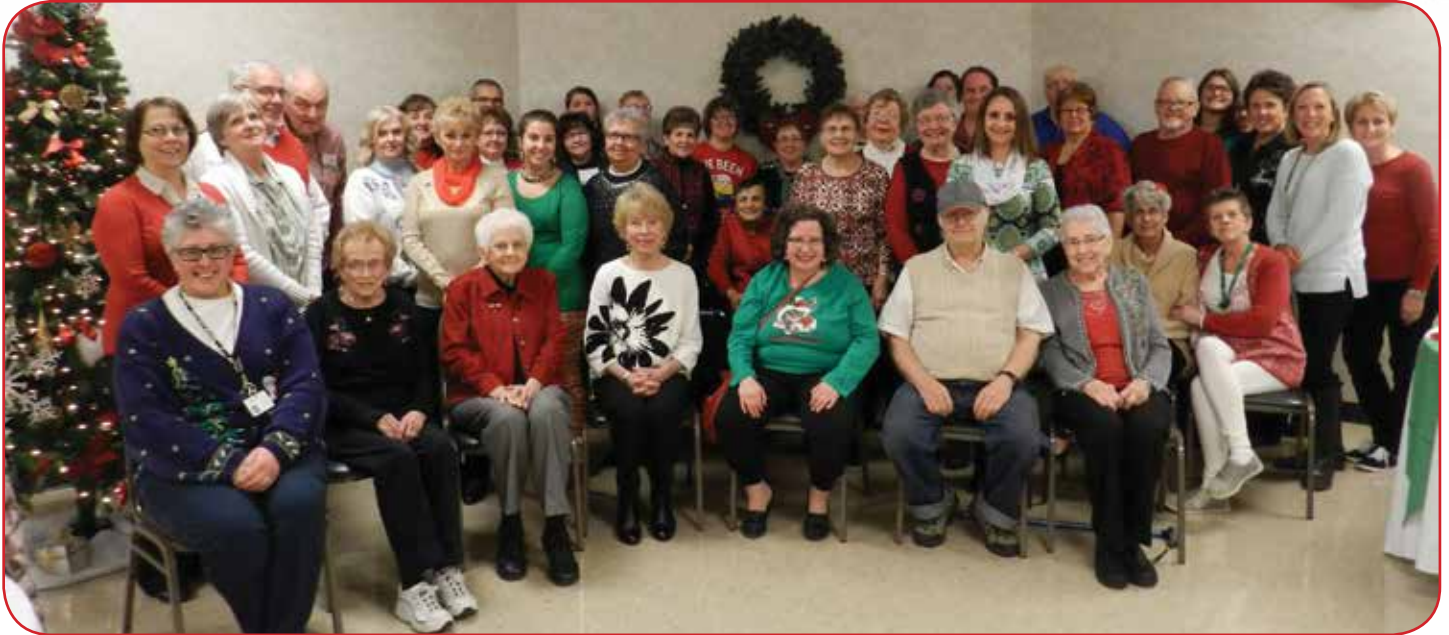
The Friends of Saint Mary's 2017 Christmas Party